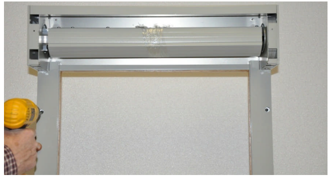
6. Attach the rails to the wall.