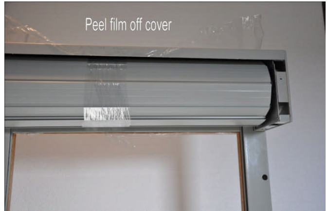
2. Remove protective film from box covers.