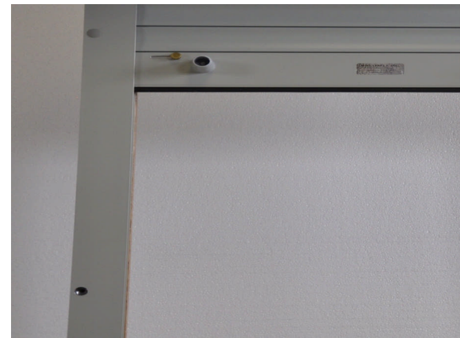
16. Install rail hole plug buttons.