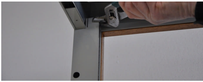
11. Form front rail guide. Use channel lock pliers to bend front ear of rail forward 30 degrees. This forms guide for slat to flow into rail.