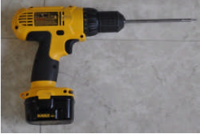
Power driver with 6" Phillips #2 tip is best tool to install the shutter.