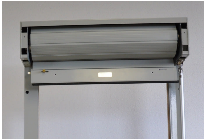
9. Remove dead bolts if installed and raise shutter completely. Drop shutter slat into rails.