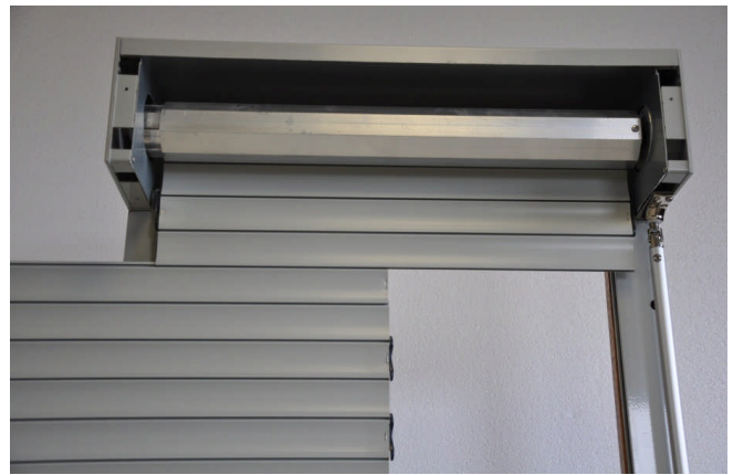
8. Unwrap slat from axle and hang outside of rails. Attach balance of slat bundle and raise shutter with crank.