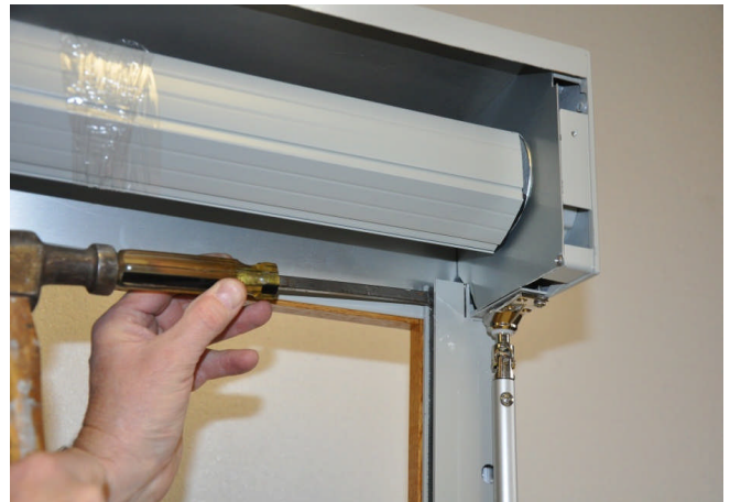
10. Form side side of rail by pushing top sideways 1/8"