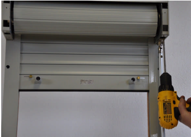
13. Remove crank handle so cover can be installed.