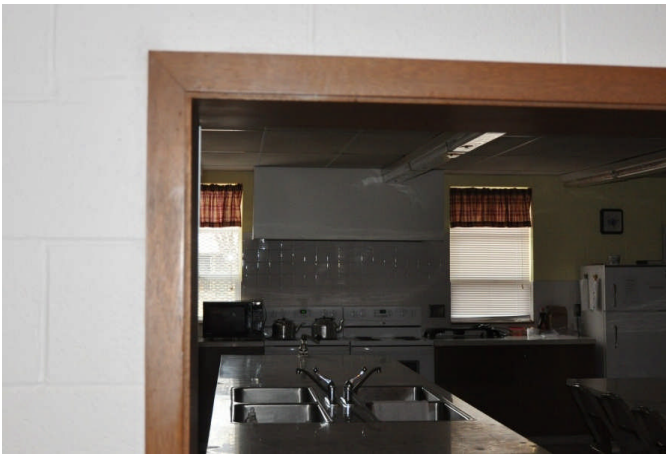
1 Remove casing from jamb if present. Shutter needs to be mounted on a flat surface.