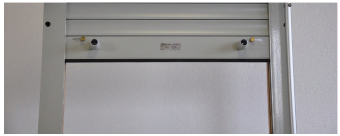
12. Reinstall dead bolts and add stops to keep shutter from going into box cover when raised. Check operation of shutter.