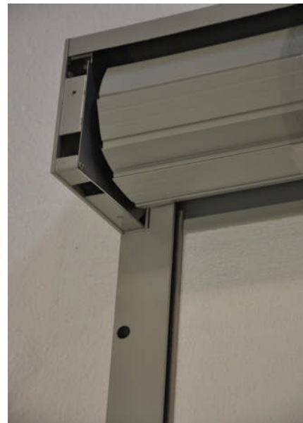
4. Rail totally on locator leg.