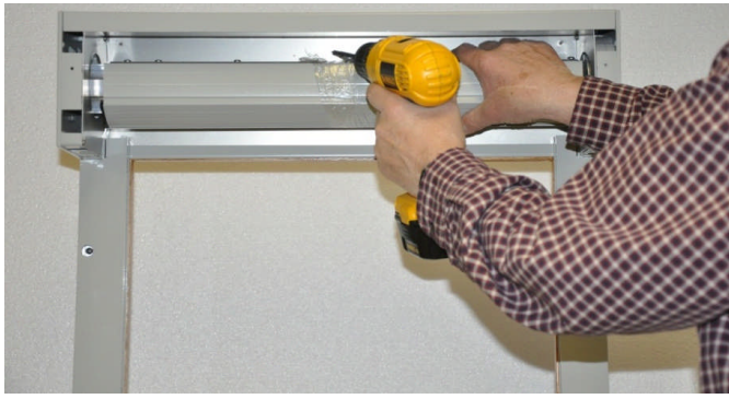
5. Set rails and storage box to the wall location. Always support box until attached to wall or the locator legs can break. They are not load bearing.