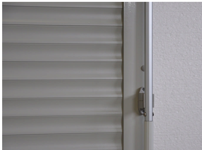
15. Attached crank handle clip to edge of rail.