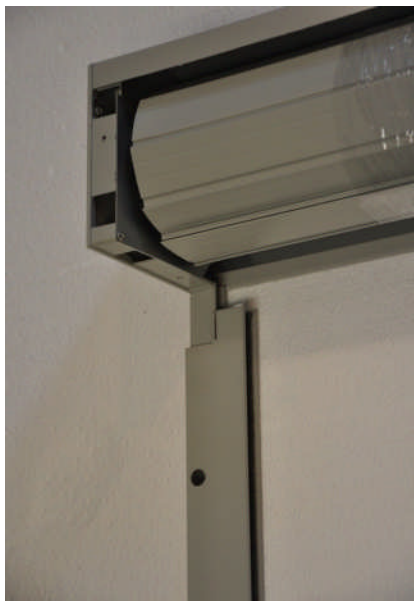
3. Slip rails onto end cap locator legs.