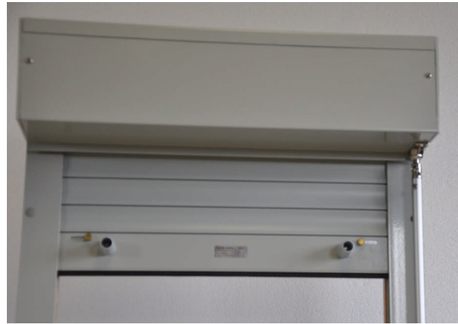
14. Attach face cover and reinstall crank handle.